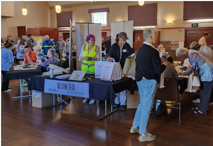
The Resilience Expo, November 2023