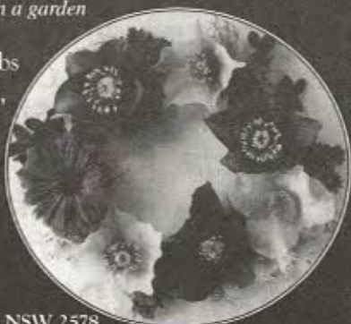
Nursery Bundanoon Village Nursery