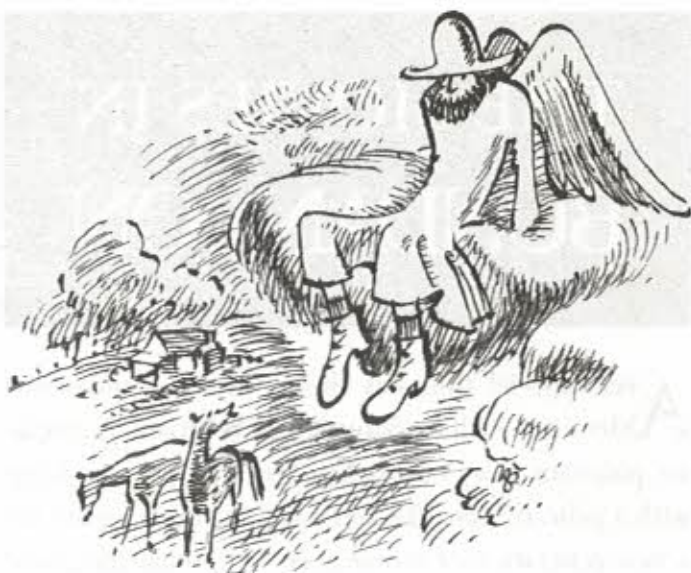
Illustration: Mim Smith

grey horse 'Cob'. "Where's this 'ere church being built, mate?" asked Ark. The minister, obviously irritated at being interrupted whilst engaged in pious thought, retorted, "And just who might you be?" "Ark Angel" came the reply. "Oh well then," responded the reverend gentlemen, obviously impressed, "In that case we should have the church up and ready for services in next to no time!"